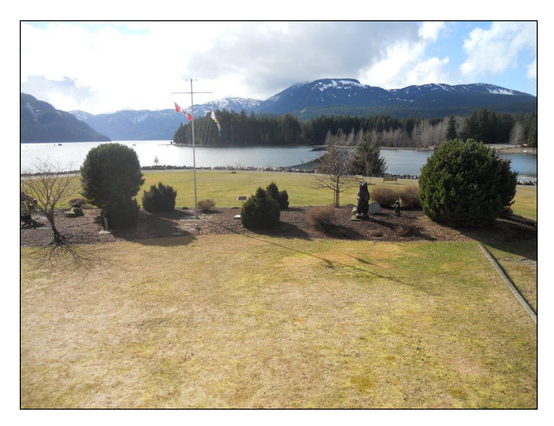
Courtenay Fish and Game Club on beautiful Comox Lake.

Directions to the Property: (from the Courtenay Fish & Game website):