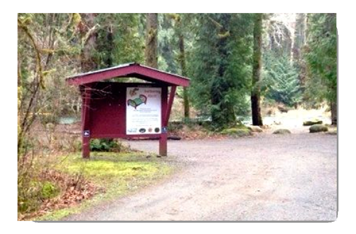
Sign at Sandy Pool boat launch on the Cowichan River.

The act of coming together to put up signage on the Cowichan River isn't within the purview of the committee, but it illustrates that the VIFFRAC works for the good of fish and anglers both within the terms of reference and outside of them. It should serve as a positive example for others.