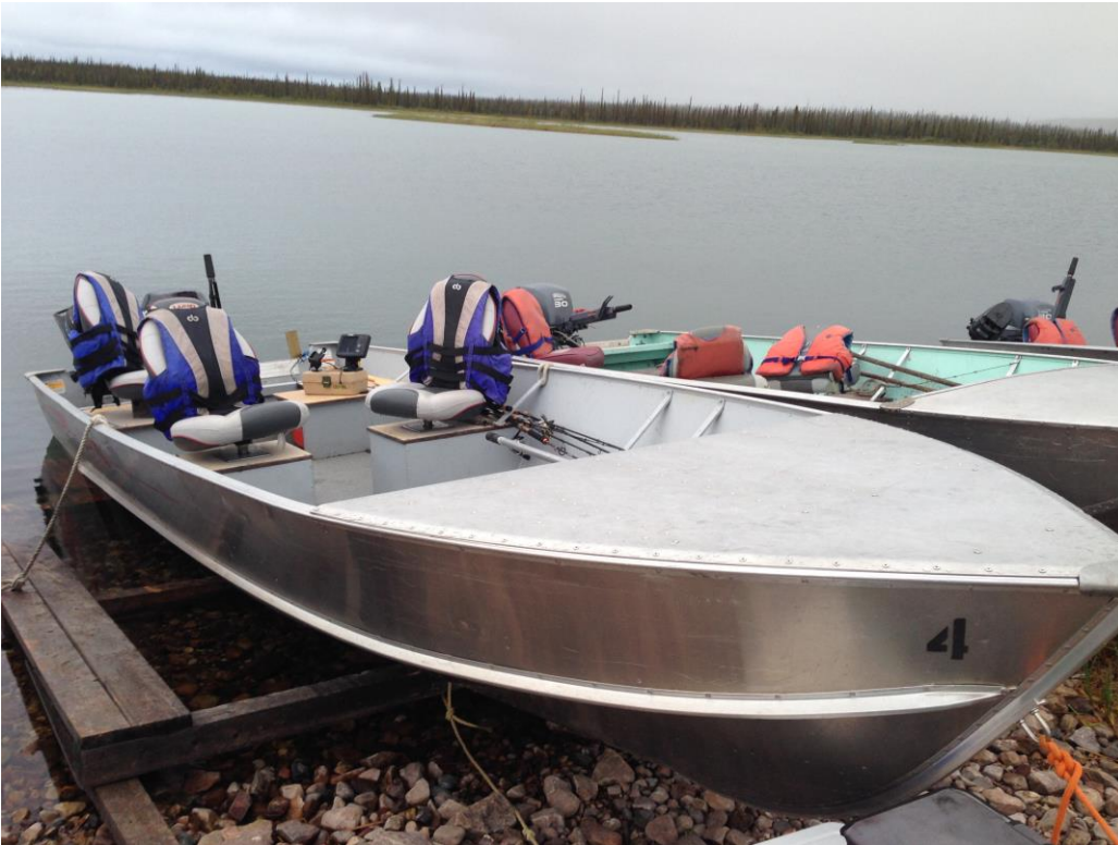
18 foot Lund

But I think the most ideal boat is like the one following: