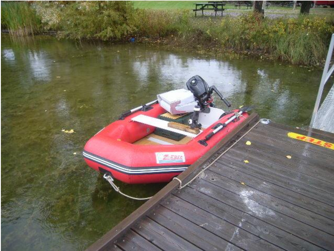
Pontoon boat 1

Although a float tube has many desirable traits, I found myself imagining some improvements. How about a floor to keep all the gear intact? How about larger diameter tubes so the fisherman can sit higher? Add a rowing frame so it can be paddled faster. Or arrange a transom so you can add a motor? And what do you get? A pontoon boat!